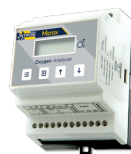
Microx Oxygen Analyser