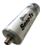
SENZTX Oxygen Transmitter