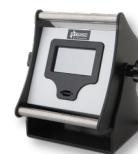
GazTrak Portable oxygen & moisture measurement